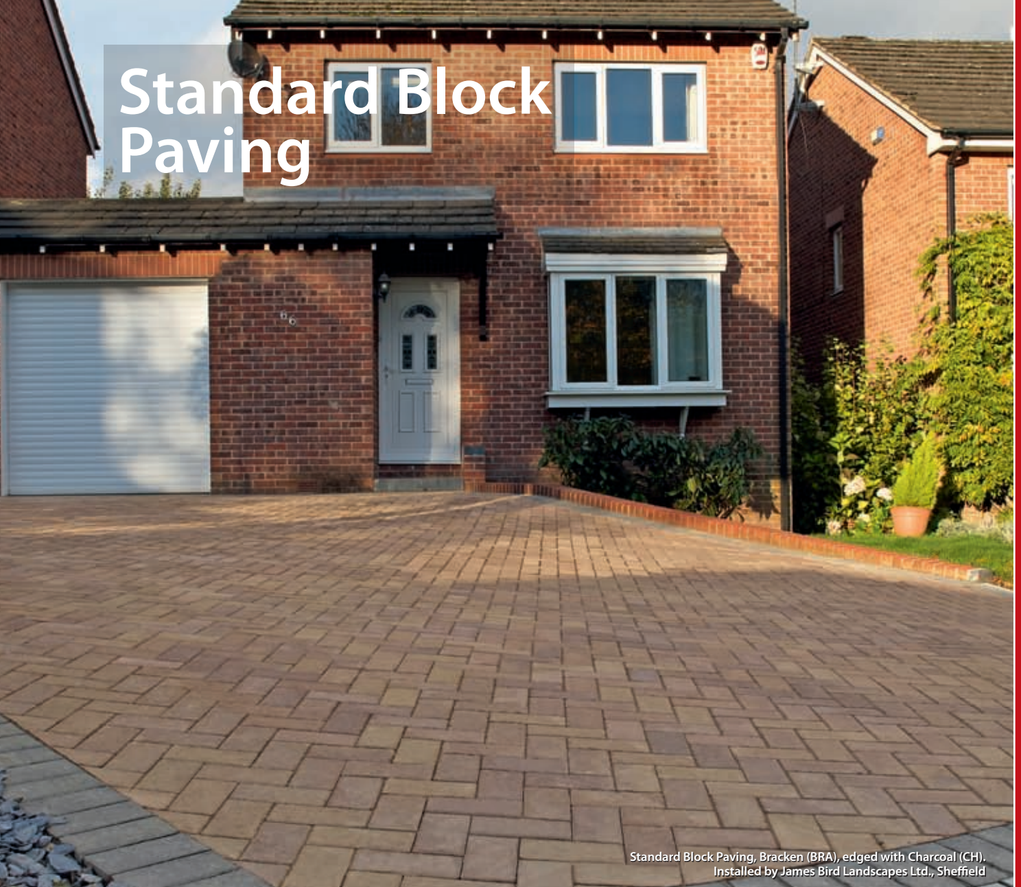
Standard Block Paving, Bracken (BRA), edged with Charcoal (CH). Installed by James Bird Landscapes Ltd., Sheffield