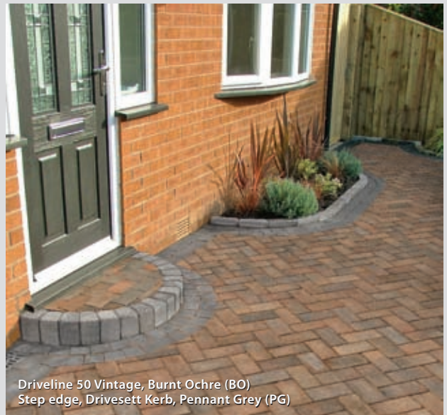
Driveline 50 Vintage, Burnt Ochre (BO) Step edge, Drivesett Kerb, Pennant Grey (PG)