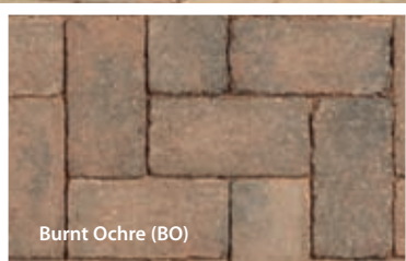
Burnt Ochre (BO)