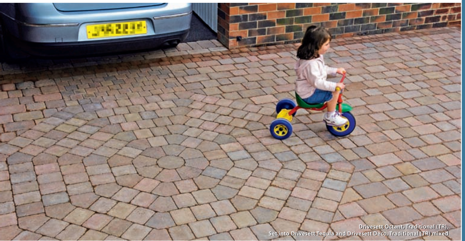
Drivesett Octant, Traditional (TR). Set into Drivesett Tegula and Drivesett Deco, Traditional (TR) mixed