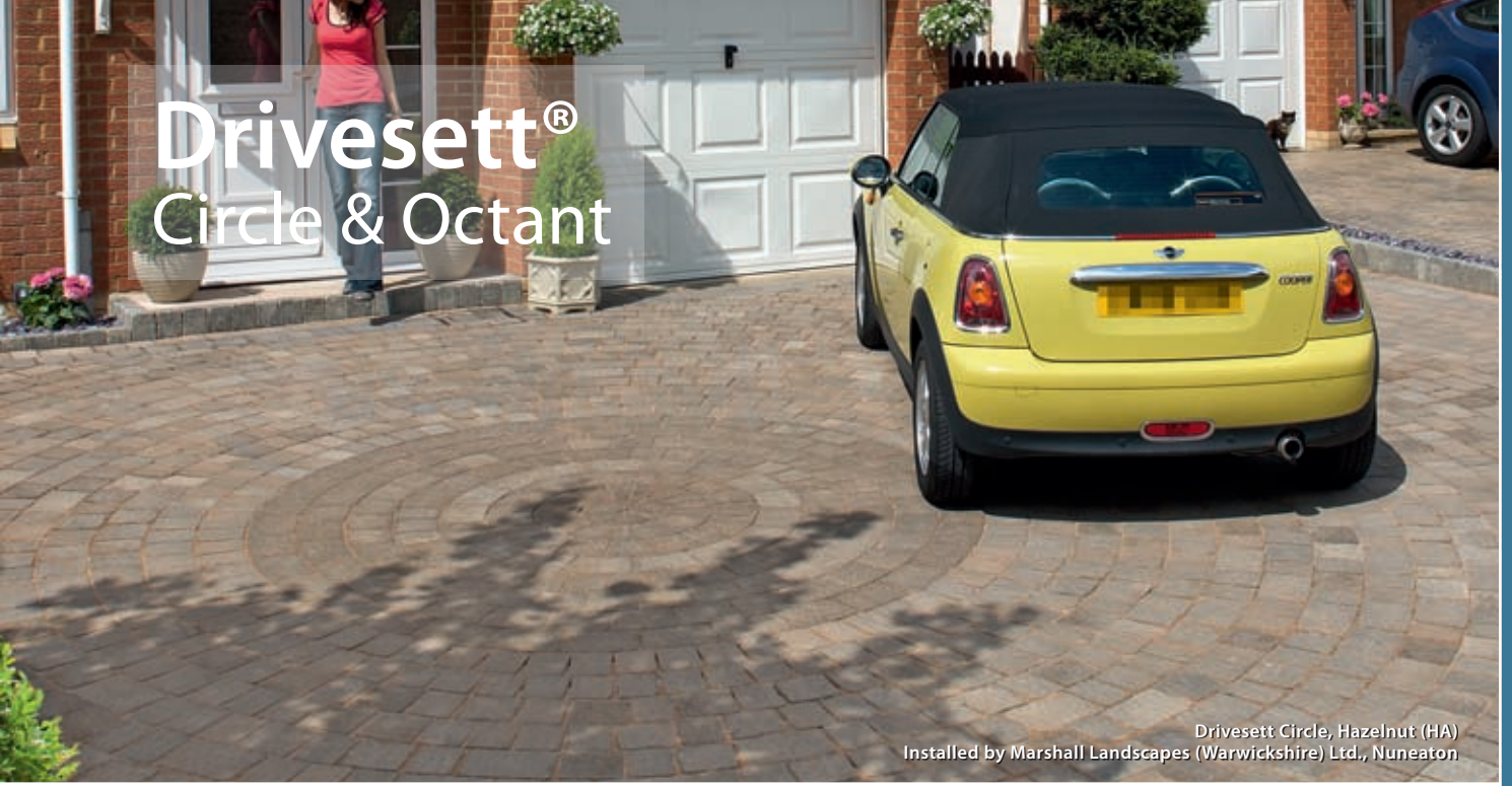
Drivesett Circle, Hazelnut (HA) Installed by Marshall Landscapes (Warwickshire) Ltd., Nuneaton