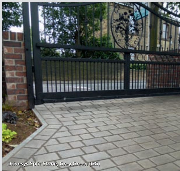
Drivesys Split Stone, Grey Green (GG)

Marshalls recommends the patented Drivesys Driveway system is installed by Marshalls Register Installers