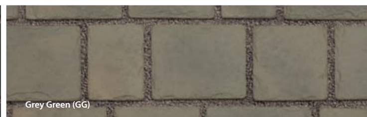
Grey Green (GG)